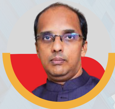
Mr.Sandeep V Regional Labour Commissioner Govt of India