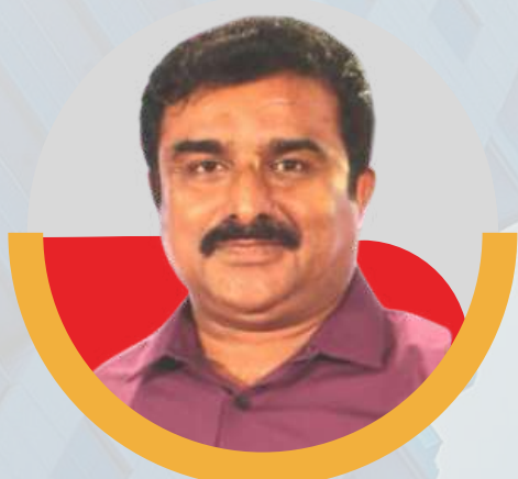
Dr.Manjunath.G Additional Labour Commissioner Govt of Karnataka